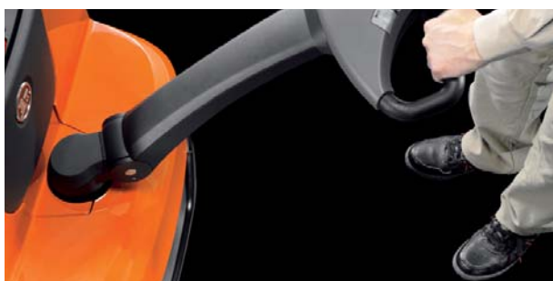
BT Levio's rounded skirt balances safety with manoeuvrability

BT Levio's chassis skirt is just 35 mm from the ground and rounds away from the operator's feet, providing the perfect balance of foot protection without compromising the truck's manoeuvrability on ramps and other slopes.