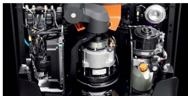
The fixed motor has no moving cables