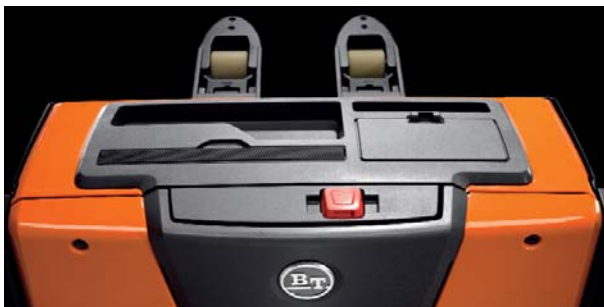
Fork tips are visible from the operating position

All BT Levio models come with useful storage compartments on top of the truck body. An optional 'E-bar' allows mounting of a writing table and shrinkwrap holder, as well as powered third-party equipment such as PCs, radio-data terminals and barcode scanners.