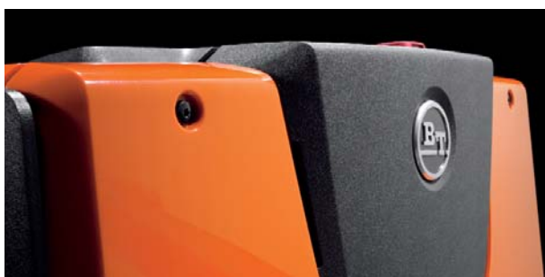
The hood is secured by two bolts for fast access

Fleet users can readily assess the performance of their BT Levio trucks using Toyota I_Site – an information system from Toyota Material Handling Europe which provides the information that fleet users need to make the right decisions for their business, quickly and safely. Toyota I_Site experts help companies set up customised, easy-to-read reporting that helps businesses realise cost savings and enhance safety, control costs from damages, as well as optimise the use of their fleet.