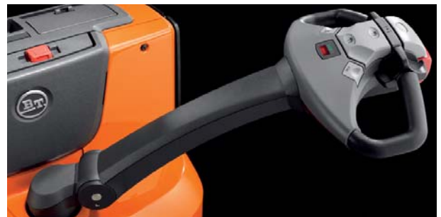
The all-new tiller arm, incorporating BT Powerdrive technology, offers easy, intuitive control