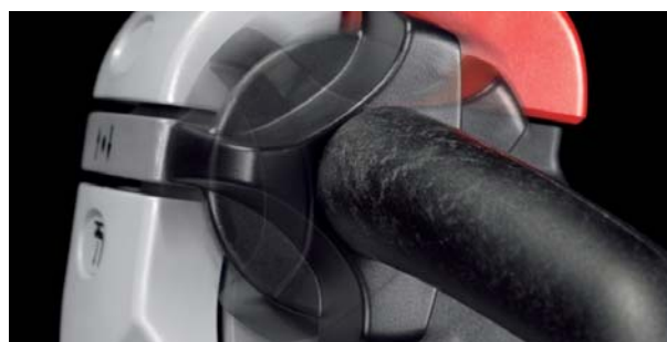
The Click-2-Creep function allows the truck to be manoeuvred with the handle upright